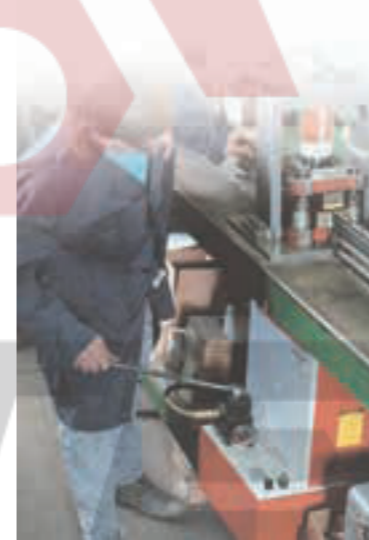
Hydraulic Machine Press Operation.