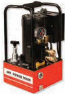
PE30TWP Torque Wrench Applications See page 171