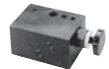
9560 – Pressure regulator. Adjustable from 70 to 700 bar. All mounting hardware included. Wt., 1,4 kg.

NOTE: Amp draw at 700 bar; 6 amp at 115 volt, 3 amp at 230 volt, and 35 amp at 12 volt.