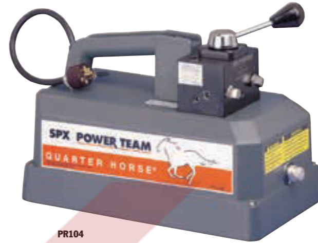
PR104 700 bar