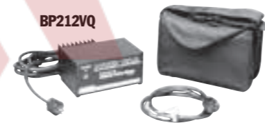
BP212VQ – Optional 12 volt battery pack. Includes sealed lead acid battery, 115V charger, 1,2 m cord, carrying case and shoulder strap. Wt., 8 kg.