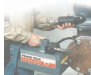
The Quarter Horse pump has a maximum operating pressure of 700 bar, which handles a wide variety of hand held hydraulic tools.